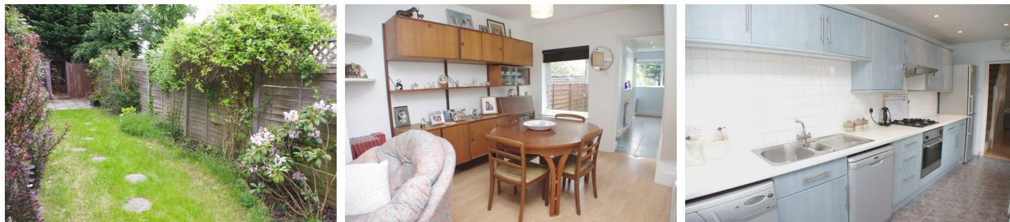
Ground Floor Approx. 31.7 sq. metres (341.0 sq. feet)

A lovely two bedroom terraced cottage on Boundary Road, in the popular Bernards Heath area, close to the shopping and leisure facilities of the city centre and mainline railway station. The property benefits from a lounge/dining room, fitted kitchen, two bedrooms and an upstairs bathroom. Further benefits include gas central heating, double glazing, front and rear gardens and is being offered for sale with the added benefit of no upper chain.